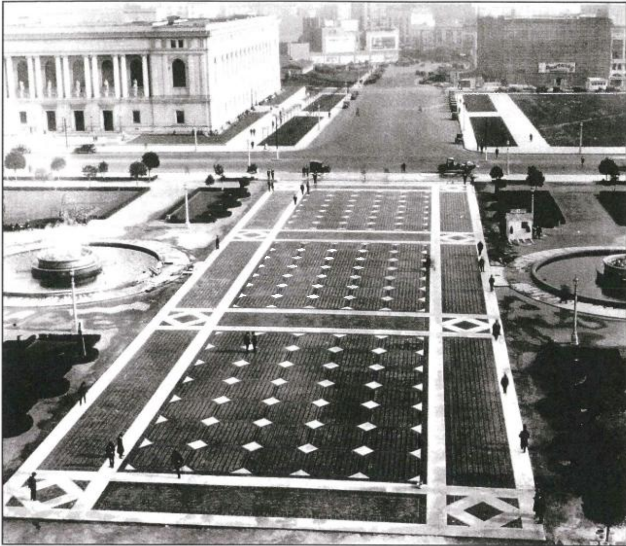
Fulton Street, 1935.

The major problem is that the plaza is too big, is isolated from surrounding areas, and does not have surrounding activities which add to the daily pulse of life. From a human scale and activity point of view, the size of United Nations Plaza is not fitted with the level of activities that can be supported there on a regular basis. Fulton Street, at 160 feet, is wider than Market Street, and has none of its vehicular or transit functions nor its adjacent retail uses. The 2.6 acre plaza is larger than Union Square, but does not have the surrounding concentration of retail activity which might warrant its size. Adjacent buildings don't contribute to the life of the plaza. Blank walls and the lack of building entries and ground floor uses do little to generate activity and therefore put a much greater burden on the physical structure of the space itself and the elements within it. Common daily flows of activity, such as the movement of people, the transfer from one transportation mode to another, stopping for goods and services, buying a newspaper, getting shoes shined, picking up groceries, all energize a city and contribute to numerous social interactions that make people feel a part of a place.